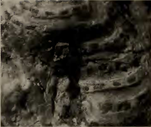
Figure 3. A part of the brachial valve of Coscinophora magnifica Cooper and Grant, 1974, showing details of the lateral lobes, NU-B110. ( \times 3 )